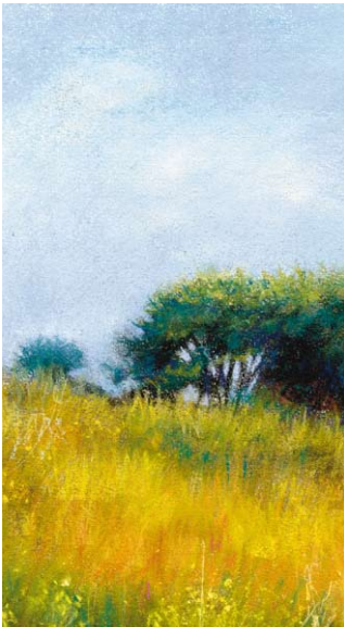
Detail "Forest landscape in La Pampa", mix technique. Claudia Espinosa